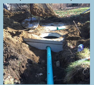
Septic replacement (in-process)